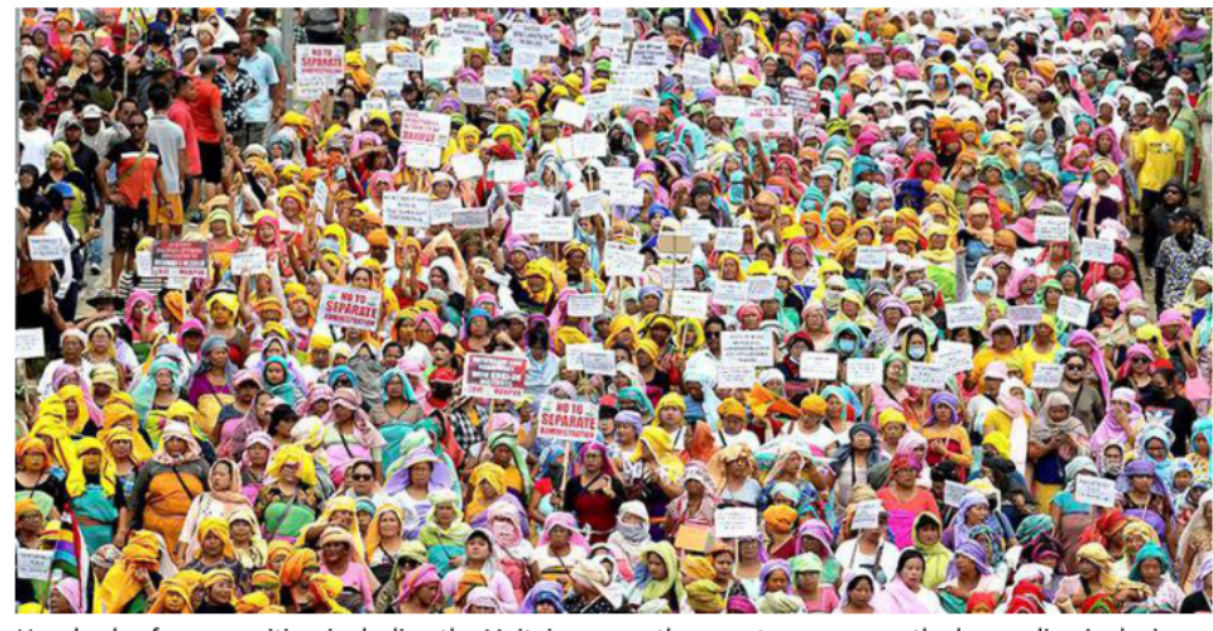
Hundreds of communities, including the Meiteis, across the country are currently demanding inclusion in the list of Scheduled Tribes.